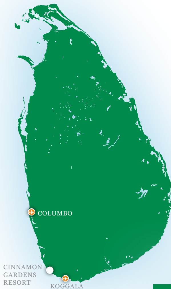
Figure 1 (left)

Cinnamon Gardens is situated in the south-west of the island. As seen in Figure 2, the land is situated away from the Indian Ocean, a significant factor in terms of Tsunami risk mitigation.